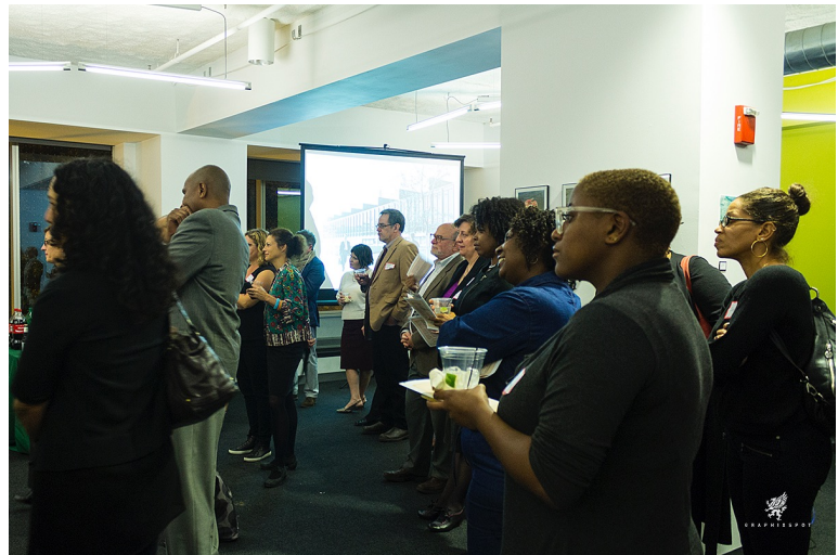
Party attendees listen intently to the speakers of the program and their thoughts on the importance of an organization such as the BMRC.