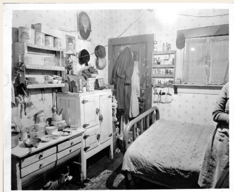
“One Room Unit at 4241 S. Evans Ave.,” ca. 1940-1959.

The inter-racial Metropolitan Housing Council was founded in 1934 to provide housing for low-income families. The Council initiated the Illinois Housing Cooperation Act, leading to the formation of the Chicago Housing Authority and the first public housing projects in Chicago. It also instigated neighborhood rejuvenation projects and helped develop Chicago's first housing code. Later known as the Metropolitan Planning Council (MPC), the organization continues as a nonprofit, non-partisan group of business and civic leaders. MPC conducts policy analysis, outreach, and advocacy in the areas of housing, transportation and urban development. The selected images are among the records which date from as early as 1934. Housed at BMRC member University of Illinois at Chicago Library of Health Sciences, the Collection also includes correspondence, reports, newspaper clippings, other photographs, minutes, newsletters, educational materials, speeches, and legislative materials. Topics of air rights, parks, housing, subsidized housing, urban renewal, landmarks, urban planning and the organization and operation of the Metropolitan Planning Council are included in the records.